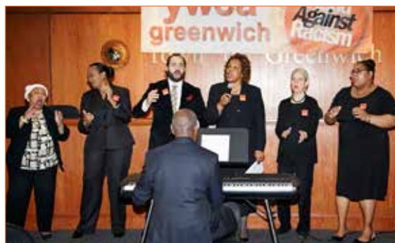
Members of the First Baptist Church Choir